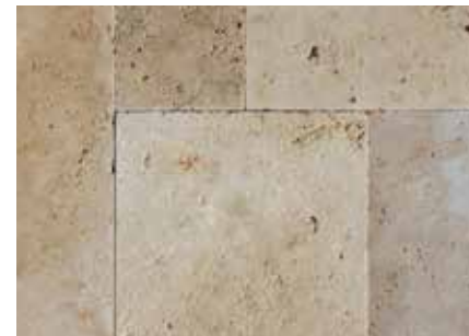
Ivory Tumbled Travertine Paver