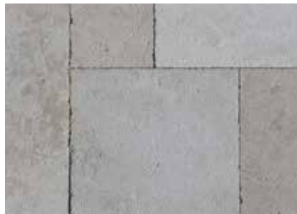
Diana Royal Leathered Marble Paver