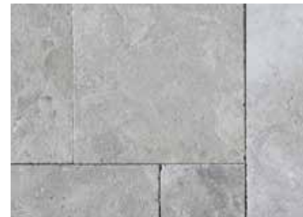
Tundra Gray Leathered Marble Paver