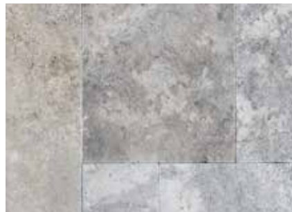
Silver Tumbled Travertine Paver