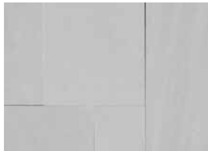
Ice White Sandblasted Marble Paver