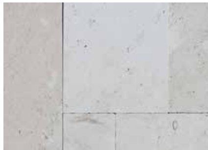
Shellstone Beige Tumbled Limestone Paver